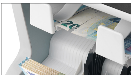
Identifies banknotes that are unfit for ATM machines and recirculation