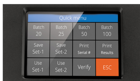
High definition touch display with multi-lingual interface and quick menu