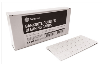
Safescan Cleaning Cards Art. no: 152-0663