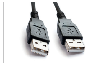
Safescan USB Cable Art. no: 124-0458