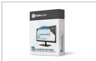
Safescan MCS Software Art. no: 124-0500