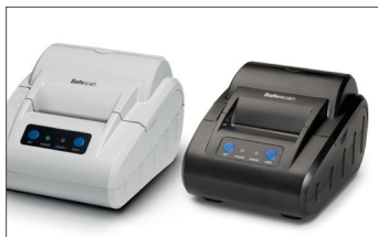
Safescan TP-230 Thermal Printer Art. no: 134-0475 Grey Art. no: 134-0535 Black